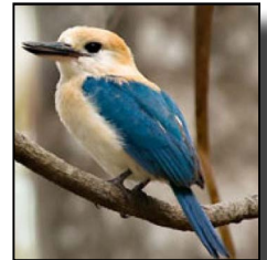
The Tuamotu Kingfisher.

For more information, go to http://cafnr.missouri.edu/news/stories2011/bringing-a-birdback-from-the-brink.php .